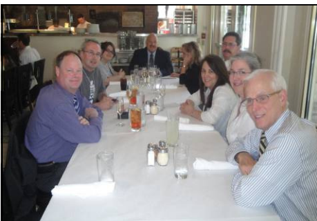
Beloit's volunteers and staff having lunch after the Opening Plenary.

"Downtown Beloit Association has an impressive track record of taking underutilized areas envisioning their best use and leveraging partnerships to achieve exemplary