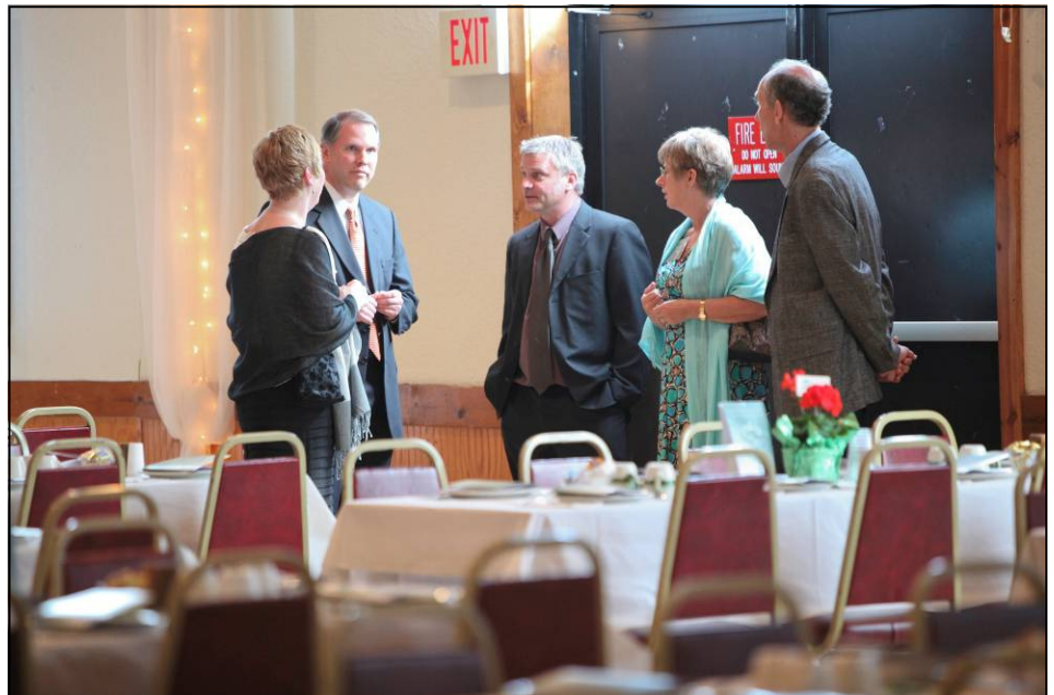
A scene from the Awards Reception

Vision Plan and Comprehensive Plan Downtown Fond du Lac Partnership/City of Fond du Lac