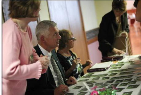
Watertown Main Street Volunteers working the registration table