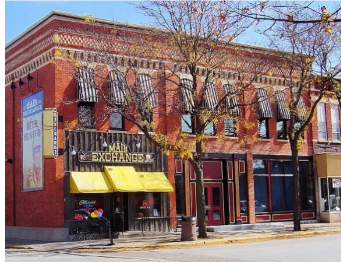
The Brick House, Fond Du Lac, before

Both the federal and Wisconsin credits can be claimed once the property is placed back into service.