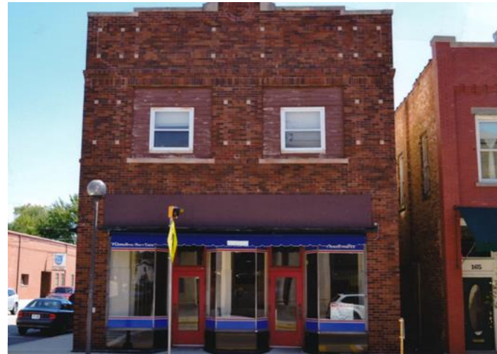
167 N Iowa Street, Dodgeville.