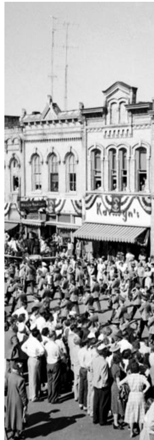
The Square in the 1950's, Ripon