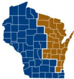
Wisconsin Tax Credit Districts

General questions can be emailed to taxcredits@wisconsinhistory.org