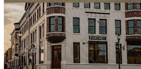
Above: Village Hall, Tigerton. Below: Hotel Fortney, Viroqua. These projects were accomplished with Historic Tax Credits.