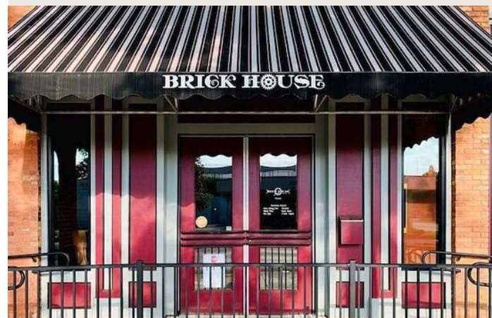
The Brick House, Fond Du Lac, after

In 2017, Laurie and Dan Baumhardt purchased a long-vacant building in an underutilized area of downtown. With consultation from the Wisconsin Historical Society, they worked on replacing the electrical system, windows, doors, and plumbing. After $500,000 of investment and new seating booths, tables, lighting, a baking kitchen, and a new bar, with the help of federal and state tax credits, the Brick House was reopened in December 2018.