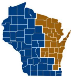
Wisconsin Tax Credit Districts

There are tax credits reviewers for the eastern and western portions of the state. General questions can be emailed to taxcredits@wisconsinhistory.org