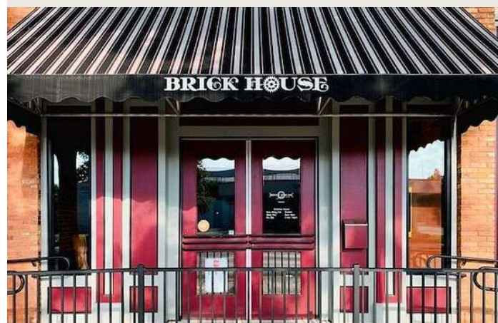
The Brick House, Fond Du Lac, after

In 2017, Laurie and Dan Baumhardt purchased a long-vacant building in an underutilized area of downtown. With consultation from the Wisconsin Historical Society, they worked on replacing the electrical system, windows, doors, and plumbing. After $500,000 of investment and new seating booths, tables, lighting, a baking kitchen, and a new bar, with the help of federal and state tax credits, the Brick House was reopened in December 2018.