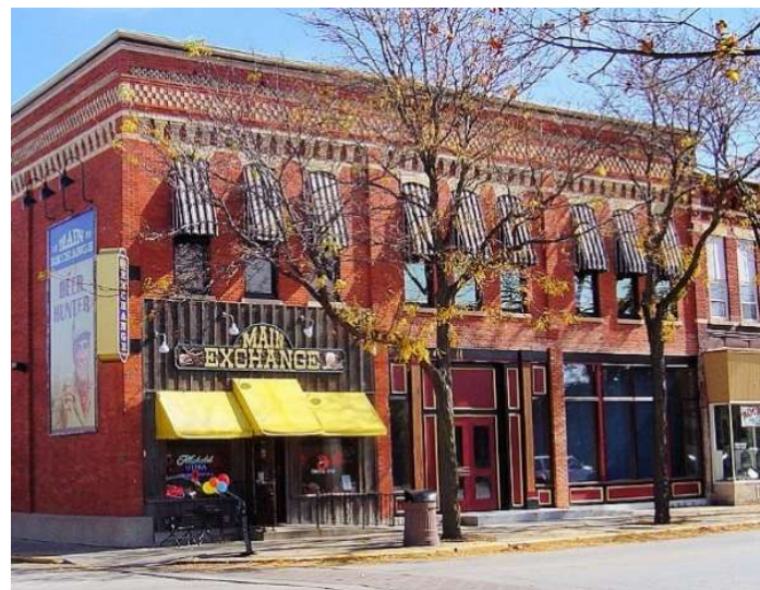
The Brick House, Fond Du Lac, before

Both the federal and Wisconsin credits can be claimed once Part 3 is completed and the property is placed back into service.