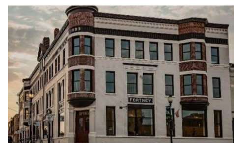
Above: Village Hall, Tigerton. Below: Hotel Fortney, Viroqua. These projects were accomplished with Historic Tax Credits.