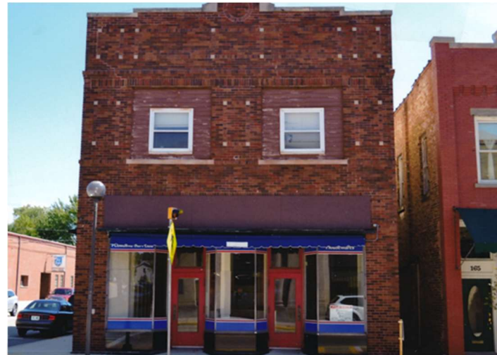
167 N Iowa Street, Dodgeville